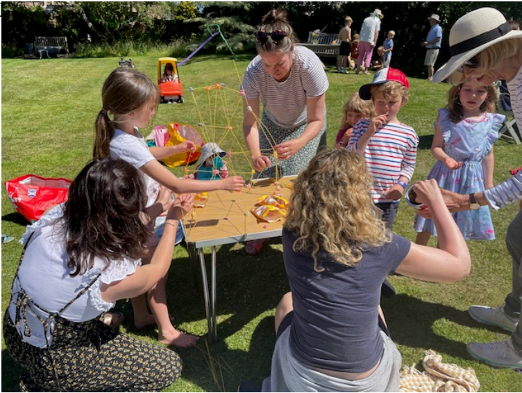
Jam Club Picnic - July