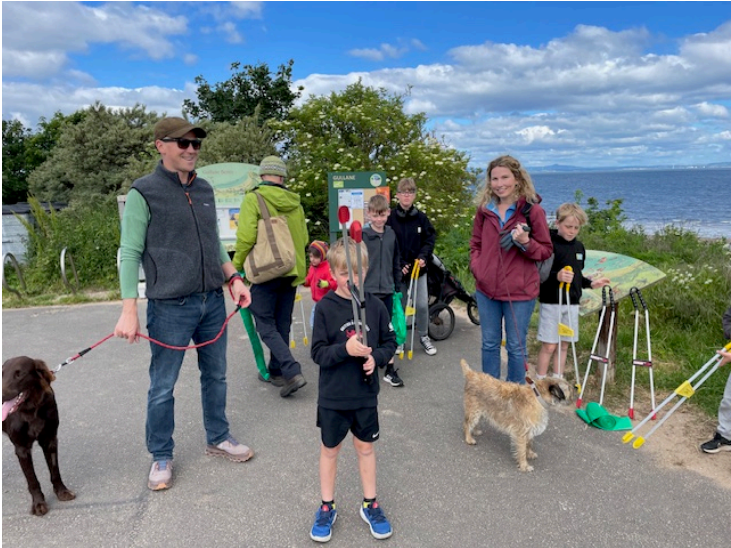
Jam Club beach clean - July