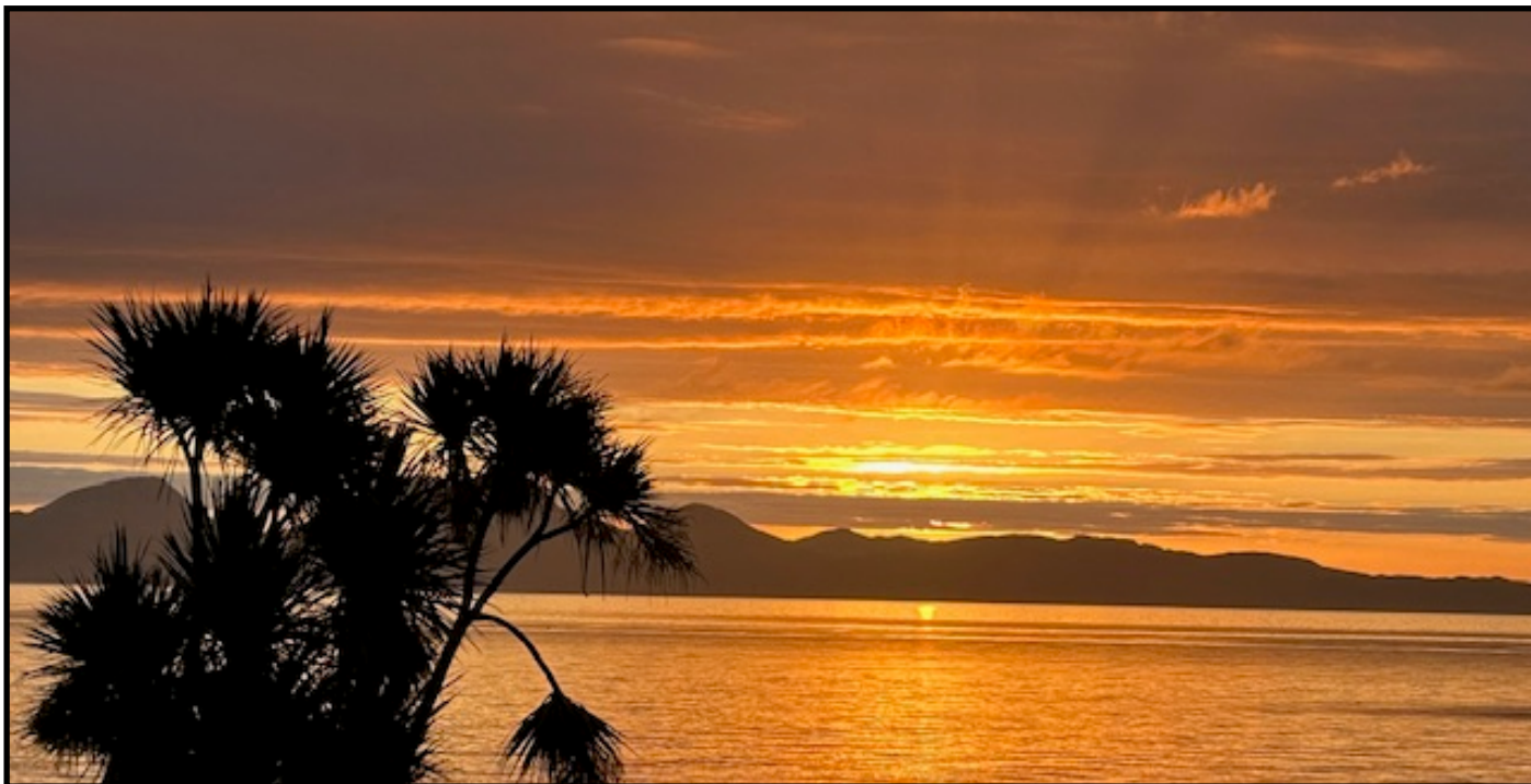
Sunset over Jura - Photograph taken from mainland early August 2024

You are warmly invited to join us in the SACRAMENT OF HOLY COMMUNION