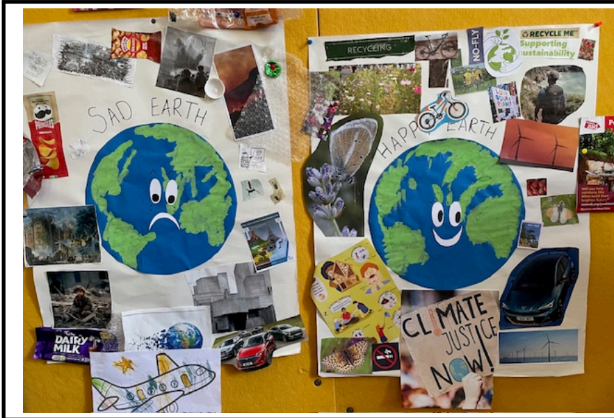
JAM CLub Sustainability Craft July