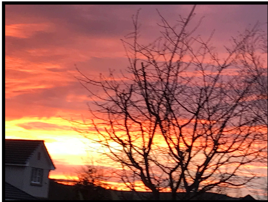
Early spring sunset

You are warmly invited to join us in the SACRAMENT OF HOLY COMMUNION