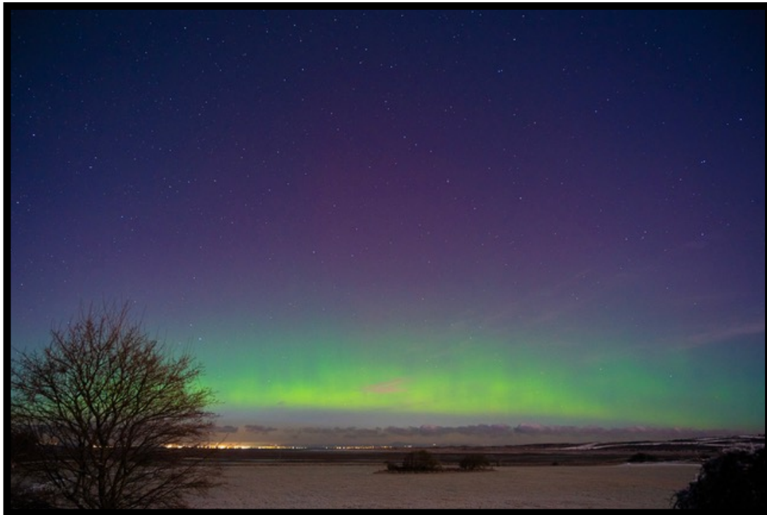
Photograph of the Aurora Borealis taken from the north side of Aberlady Church

You are warmly invited to join us in the SACRAMENT OF HOLY COMMUNION