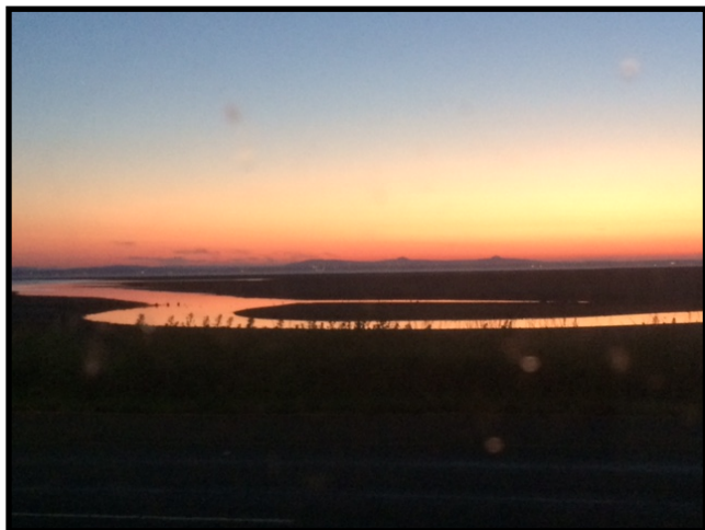
Summer sunset on Aberlady Bay