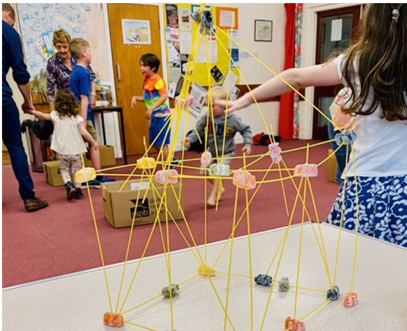
The Jelly baby/spaghetti game