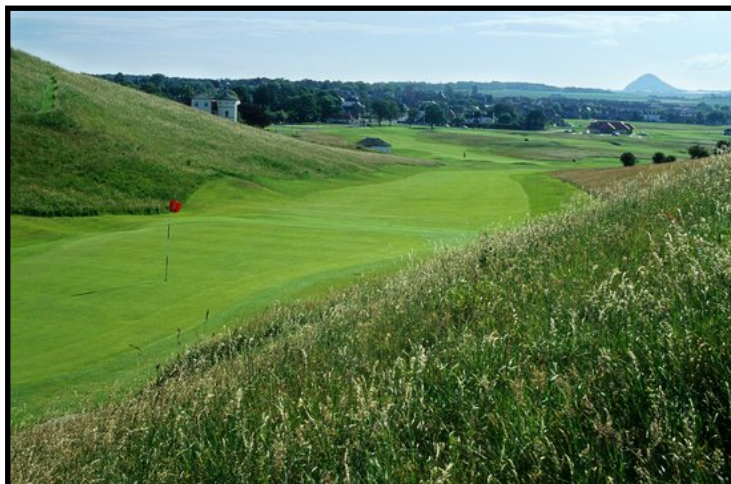
Berwick Law from Gullane Golf Course

You are warmly invited to join us in the SACRAMENT OF HOLY COMMUNION