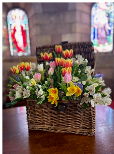
Gullane Church Easter Flowers

Aberlady Church has a number of volunteers to arrange a flower display for Sunday worship but as you can see from the following we still rely on silk flower displays for the months without volunteers.