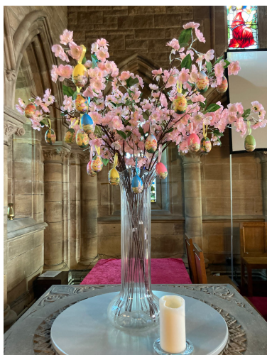
Aberlady Church Easter Flowers

The ladies from both Aberlady and Gullane, have been preparing flower arrangements for both churches. Many thanks to all concerned.