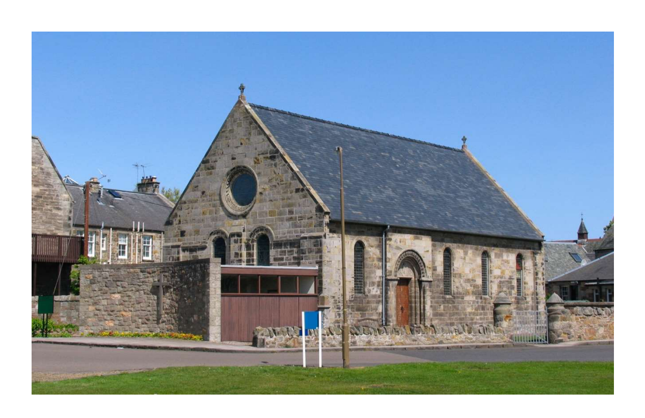
Aberlady and Gullane Parish Church Parish Profile Presbytery of Lothian Charity Number SC005237