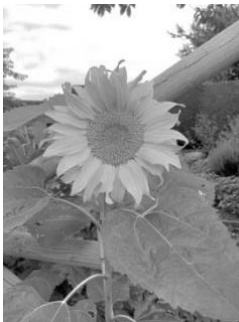
A result of the planting