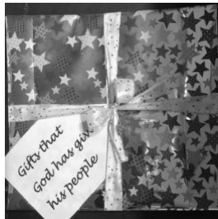
Current JAM Club theme